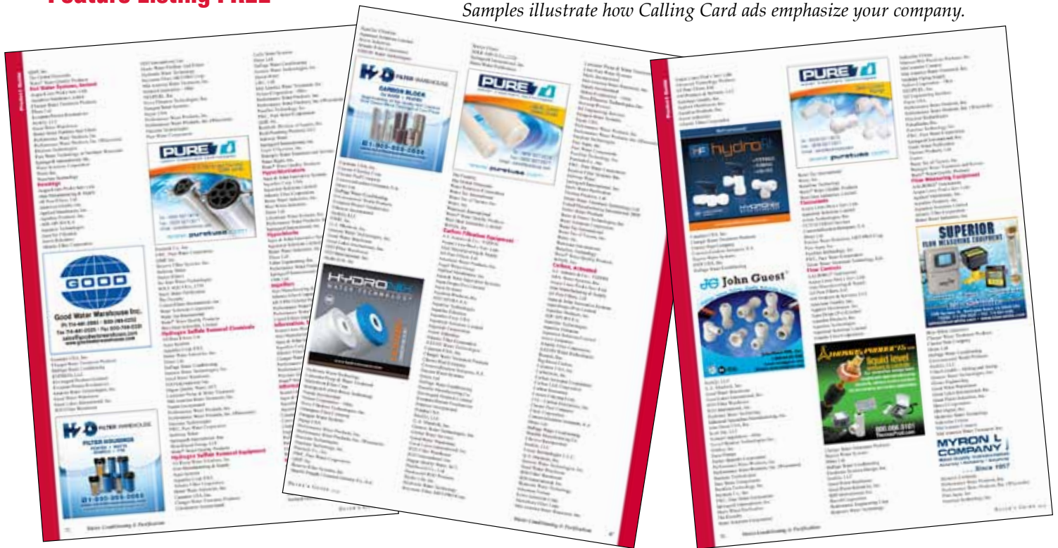
Samples illustrate how Calling Card ads emphasize your company.

Order 4 Calling Cards and get a Feature Listing FREE